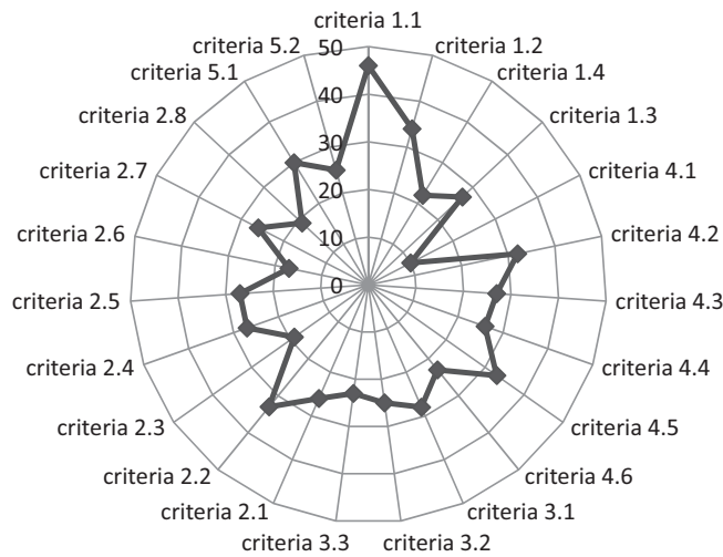
FIG. 3. Generalised data from the analyses of the efficiency of marketing model implementation in volunteer and charity organisation activities (explanations in the text)